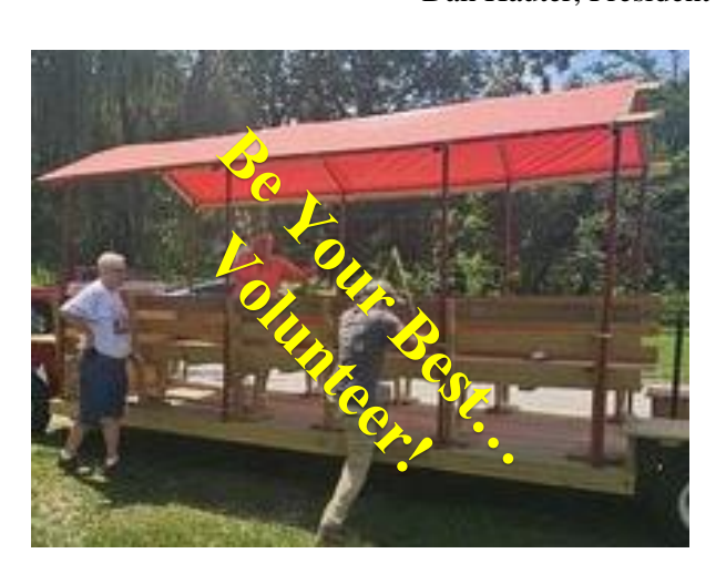
Take a Turn...

Driving or monitoring the "People Hauler!" Contact Rodney Eichen (page 7)